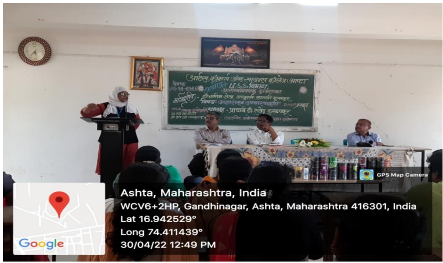
Workshop on Health and Diet