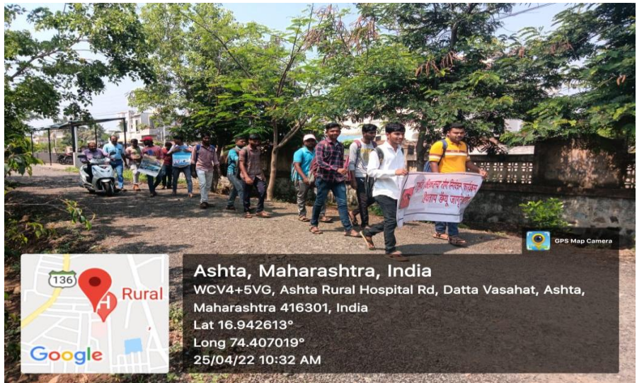
World Malaria Day Rally