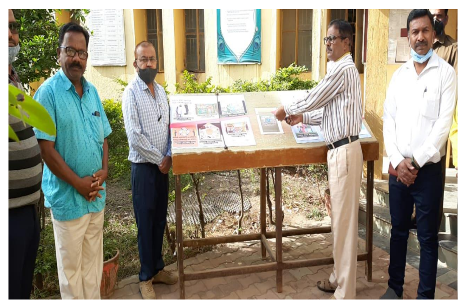
Celebrating National Voters Day