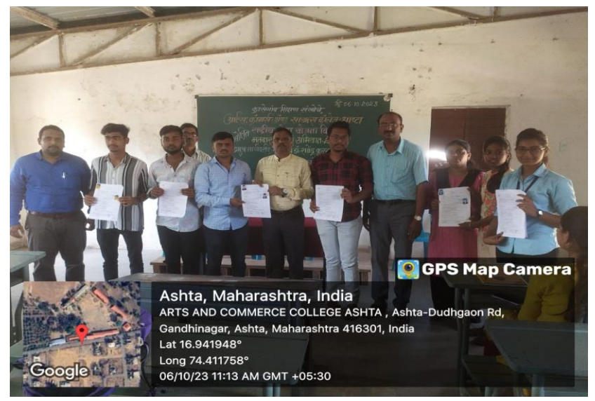
Voters Awareness and Registration Campaign