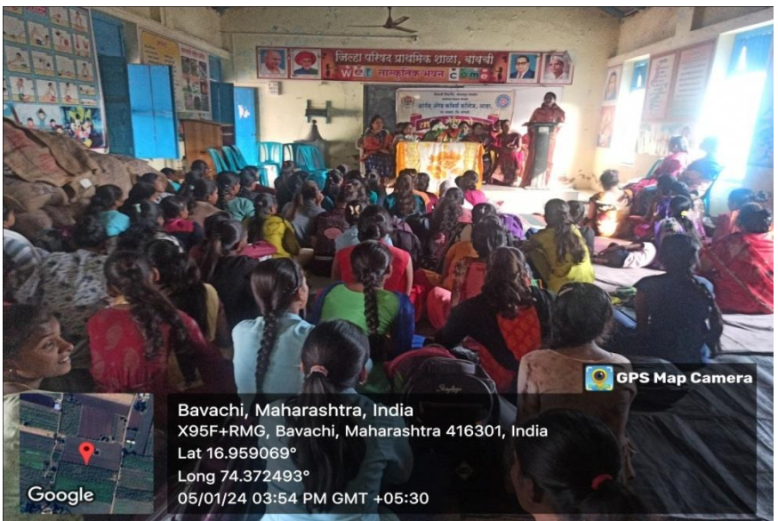
Women Empowerment Program