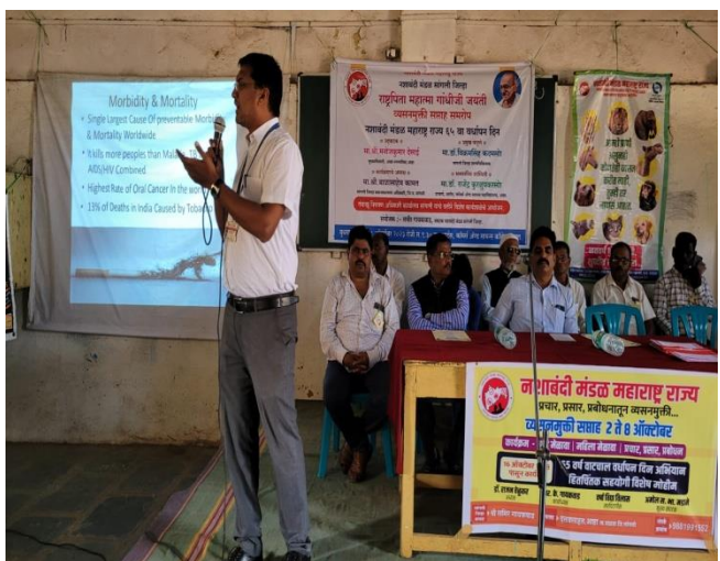
Workshop on Addiction Free Campaign