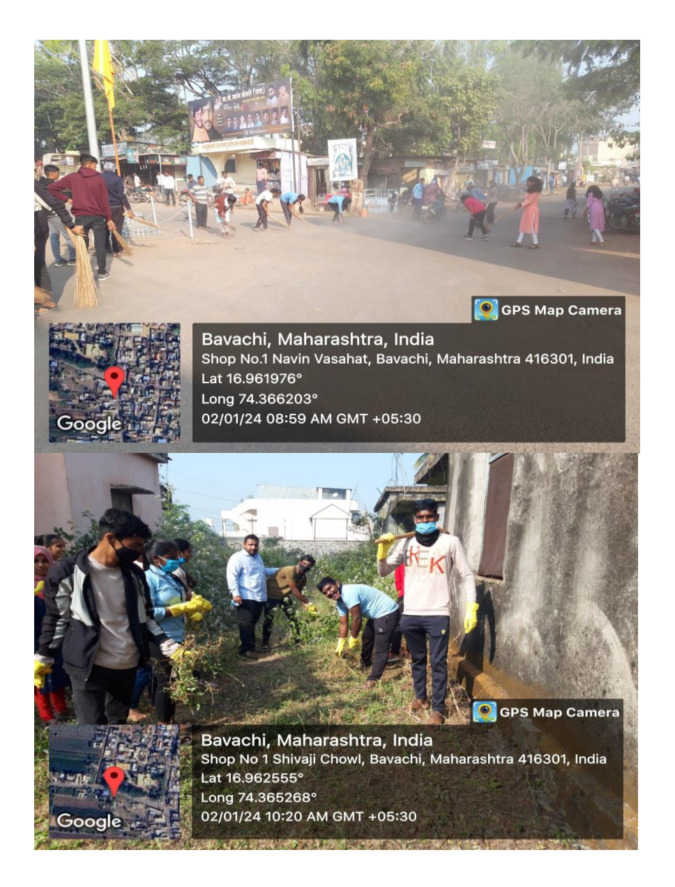
Cleanliness Campaign at Bavachi