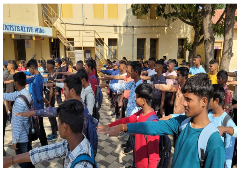
National Voters Day