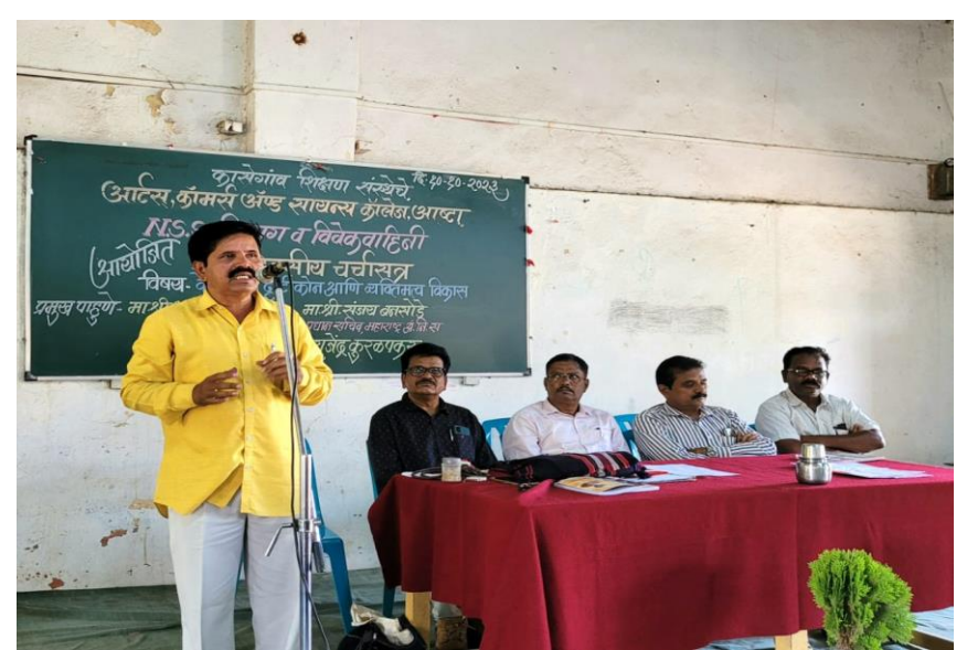
WORKSHOP ON SCIENTIFIC TEMPERAMENT AND PERSONALITY DEVELOPMENT