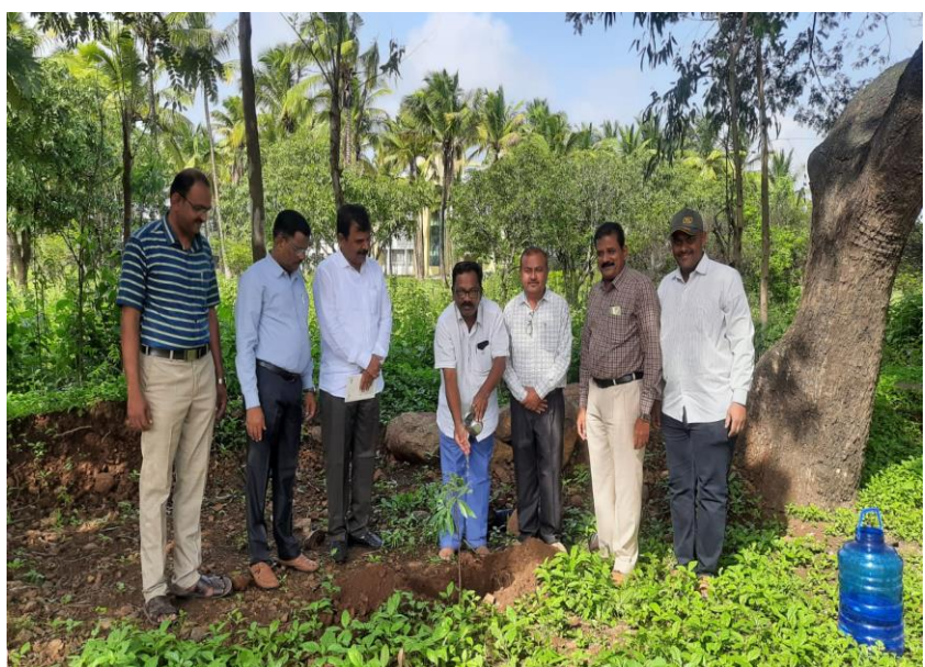
Tree Plantation Activity