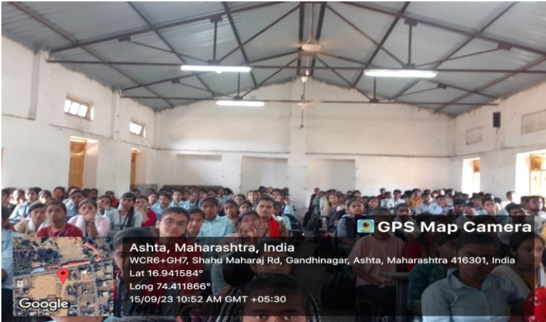
One Day Workshop On Tarunyabhan