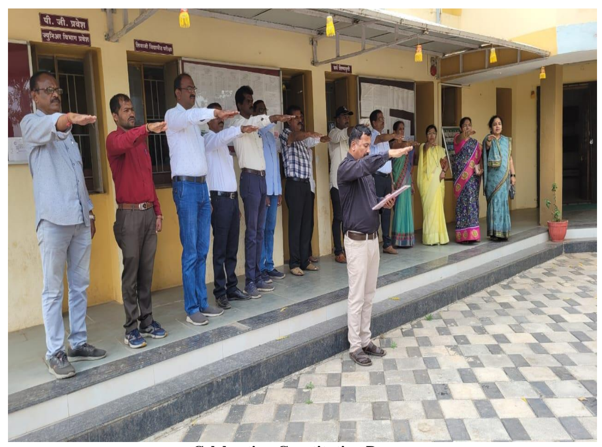
Celebrating Constitution Day