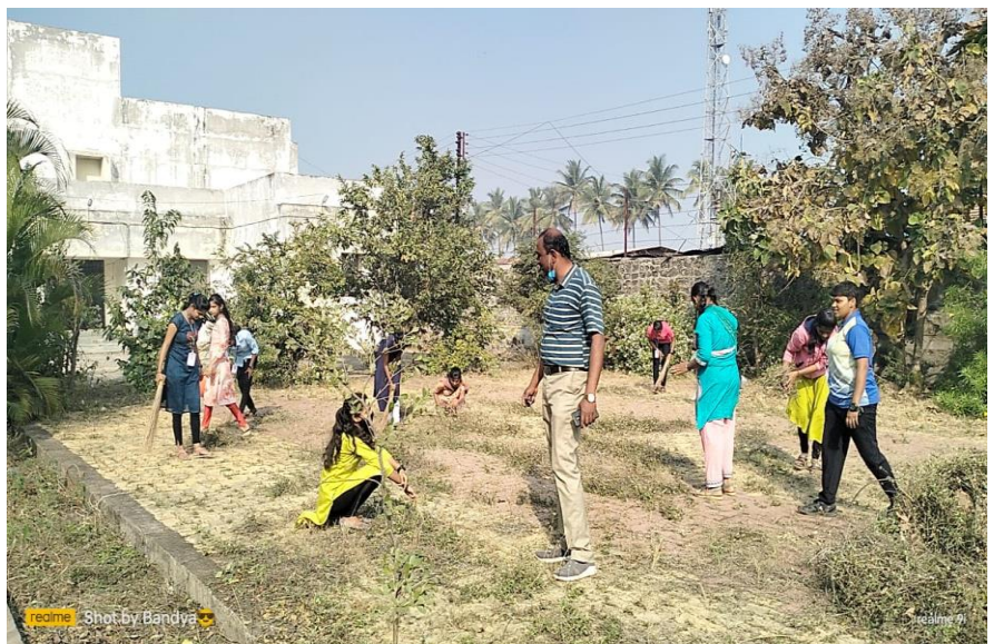
Cleanliness Campaign at Bavachi