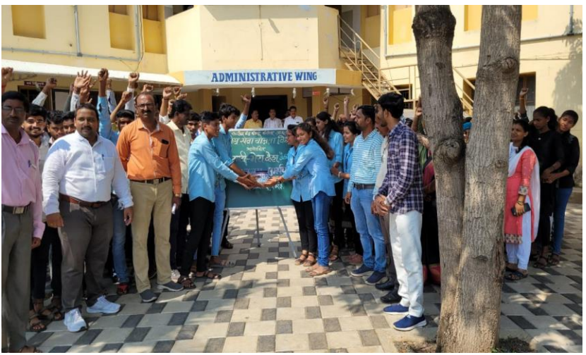
'Amrit Kalash Dedication Program'